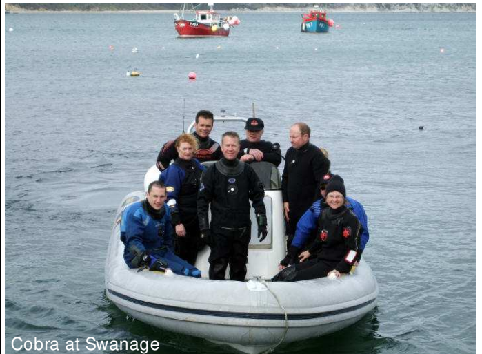
Cobra at Swanage

We had given a max time of 35 mins so we had to surface but I was glad to anyway as my drysuit had filled up, and I am even more amazed that some can dive in wetsuits in the UK... Tip to prevent this is to not search for pony necklace prior to jumping in unless you check you have put your neckseal back in place.