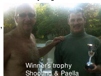
Winner's trophy Shooting & Paella