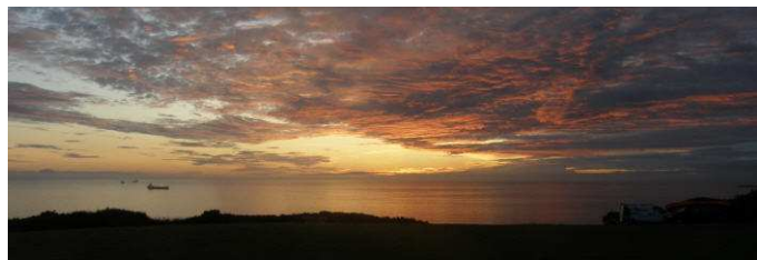
Porthkerris, view from the tent at daybreak