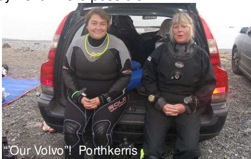
"Our Volvo!" Porthkerris

Primary regulators should not be used. Reels should not be clipped to a diver. Best practice is to use an auto inflation DSMB, or failing that a separate inflator rather than even using a secondary regulator. DSMBs should be clipped to a solid structure for deployment where possible.