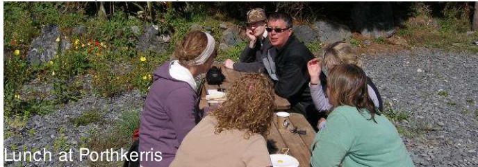
Lunch at Porthkerris